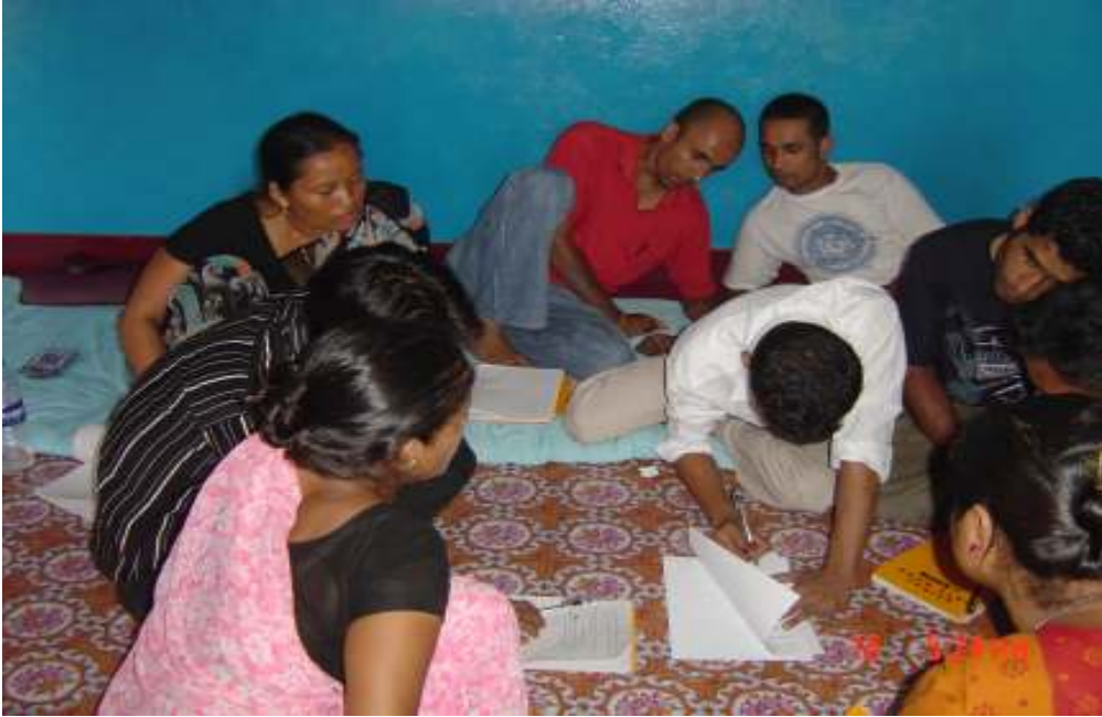
Participants in Group work on Office Management ToT in Eastern Region