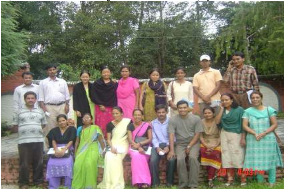
Proposal and Report Writing training participants of CCGRO Project

Sahakarya and Consolidating Capacities of Gender Responsive Organization (CCGRO) entered into agreement for coaching support on proposal development need assessment, implementation and monitoring and final project report development. In this context, Sahakarya provided support to 17 partner NGOs of CCGRO on proposal development of CBI project. Likewise coaching support to 5 Partner NGOs of mid western and far western region is being continuing. NGO members have been developed knowledge and skill on proposal development, implementation, monitoring of the project activities.