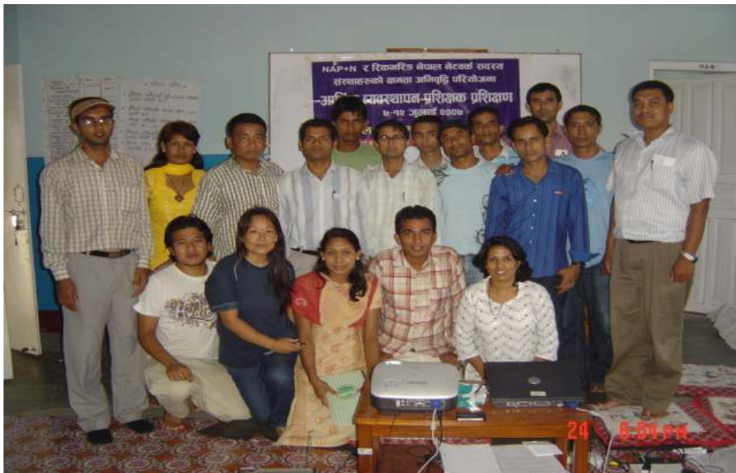
Participants Financial Management Training in Eastern Region Supported by FHI

40 organization members had developed knowledge and skill on office and financial management and improved their office and financial system. Likewise participants had developed skill on training designing, developing session plan, setting objectives, selecting training methodologies and deliver Staff and members of Sahakarya had got opportunity to strengthened their knowledge and skill on office and financial management.